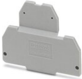
End cover, length: 44.2 mm, width: 4 mm, height: 34.6 mm, color: gray

Please be informed that the data shown in this PDF Document is generated from our Online Catalog. Please find the complete data in the user's documentation. Our General Terms of Use for Downloads are valid ( http://phoenixcontact.com/download )